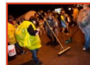
Occupy Wall Street: Park 'Cleanup' That Would...