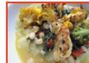
Fall Recipes From NY Food Bloggers