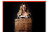
The Faces Of Occupy Wall Street